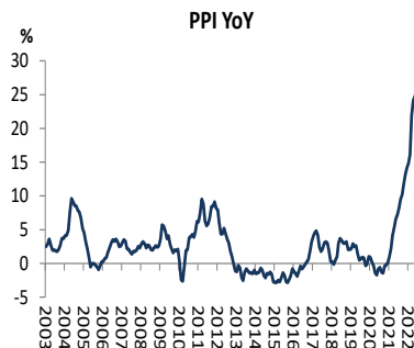
Figure 3: PPI (y/y)